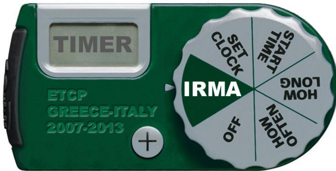
IRMA Timer | The monthly newsletter of IRMA project, Issue 08 | February 2014