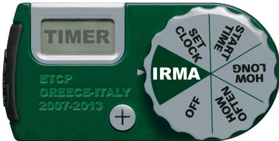
IRMA Timer | The monthly newsletter of IRMA project, Issue 09 | March 2014