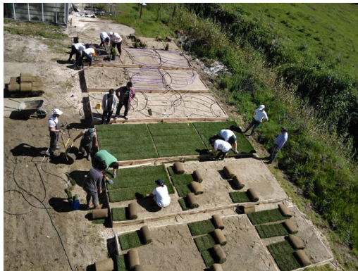
Experimental setup at TEIEP (March 2014)

All partners that are involved in research actions (P3-INEA, P4-ISPACNR and LP-TEIEP) have already begun the 2014 period experiments.